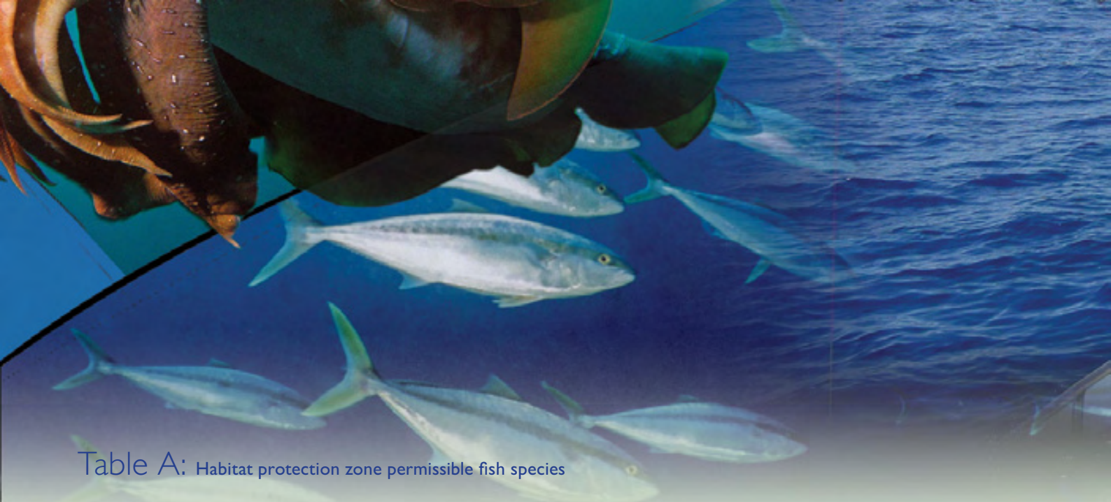
Table A: Habitat protection zone permissible fish species