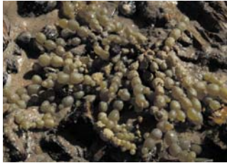
Neptune's Necklace ( Hormosira banksii ) Producer and food source for some herbivores.