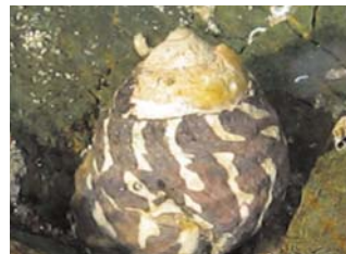
Periwinkles ( Austrocochlea spp.) Herbivore that grazes on microscopic algae and lichen.