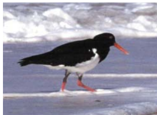
Oystercatchers ( Haematopus longirostris ) Coastal carnivore that uses its long beak to prize open oysters and other shellfish.