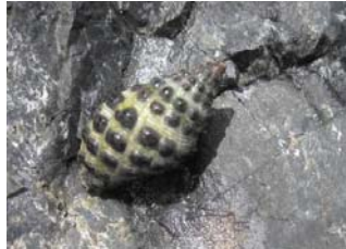
Mulberry Oyster Borer ( Morula marginalba ) Common rocky shore carnivorous snail that bores into oysters and tubeworms.