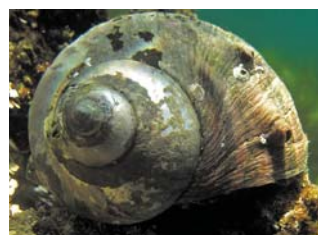
Turbos/ Googoombull ( Turbo spp.) The protective cover or operculum is used to protect the snail.