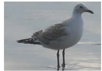
Silvergull ( Larus spp.) Scavenger that has a very diverse habitat range.