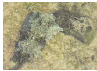
Sea Hares ( Aplysia spp.) Herbivorous snail without shells that squirt ink when upset.