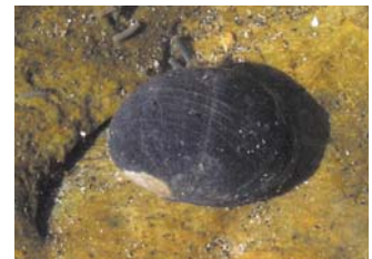
Black Nerite ( Nerita atramentosa ) Common black herbivorous snail that stays out of the sun in the day.