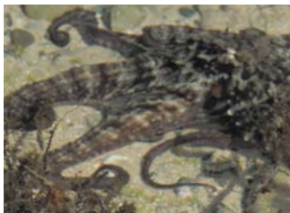
Gloomy Octopus ( Octopus tetricus ) Predator with great camouflage to sneak up on prey.