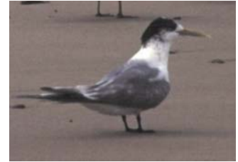
Tern ( Sterna spp.) Coastal carnivore that catches small fish by plunging several metres into the sea.