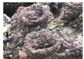
Sea squirts ( Pyura stolonifera ) Filter feeder that stores water for when the tide is low.