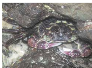
Rock Crab ( Leptograpsus variegatus ) Opportunist that is often seen grazing on algae.