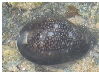
Cowrie ( Cypraea caputserpentis ) Mantle often covers the whole shell.