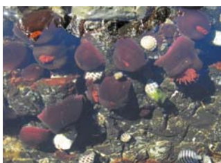
Red Waratah Anemone ( Actinia tenebrosa ) Often seen in crevices with tentacles withdrawn.