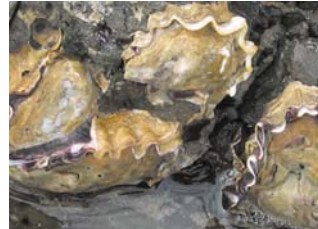
Oyster ( Saccostrea glomerata ) Filter feeding bivalve that stays firmly attached to the rocks.